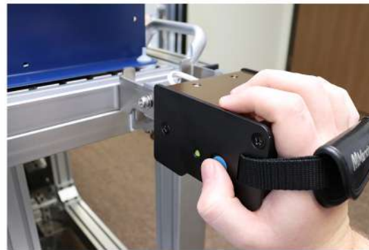
Marking from the side.