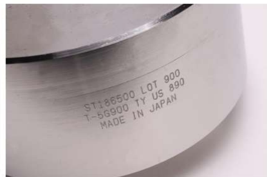
Marking on a curved surface without a rotary.