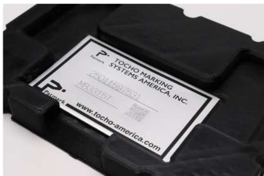
The best fit for marking small tags with QR codes.